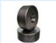
Thread rolling wheel