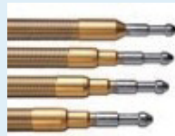
High precision spline broach