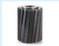
Rack milling cutter