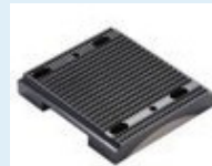
Flat multi-key rack broach