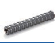
Carbide spline broach