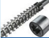
Round special broach