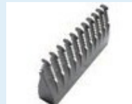
Wheel groove broach