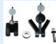
Spline measuring instrument