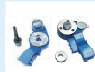
Hand-held spline meter