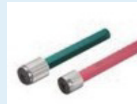
Spline plug gauge