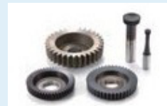
Pintooth / Roller