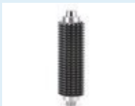
High precision hob