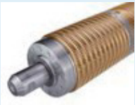
Extra large broach