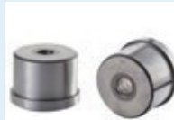
Spline extrusion die